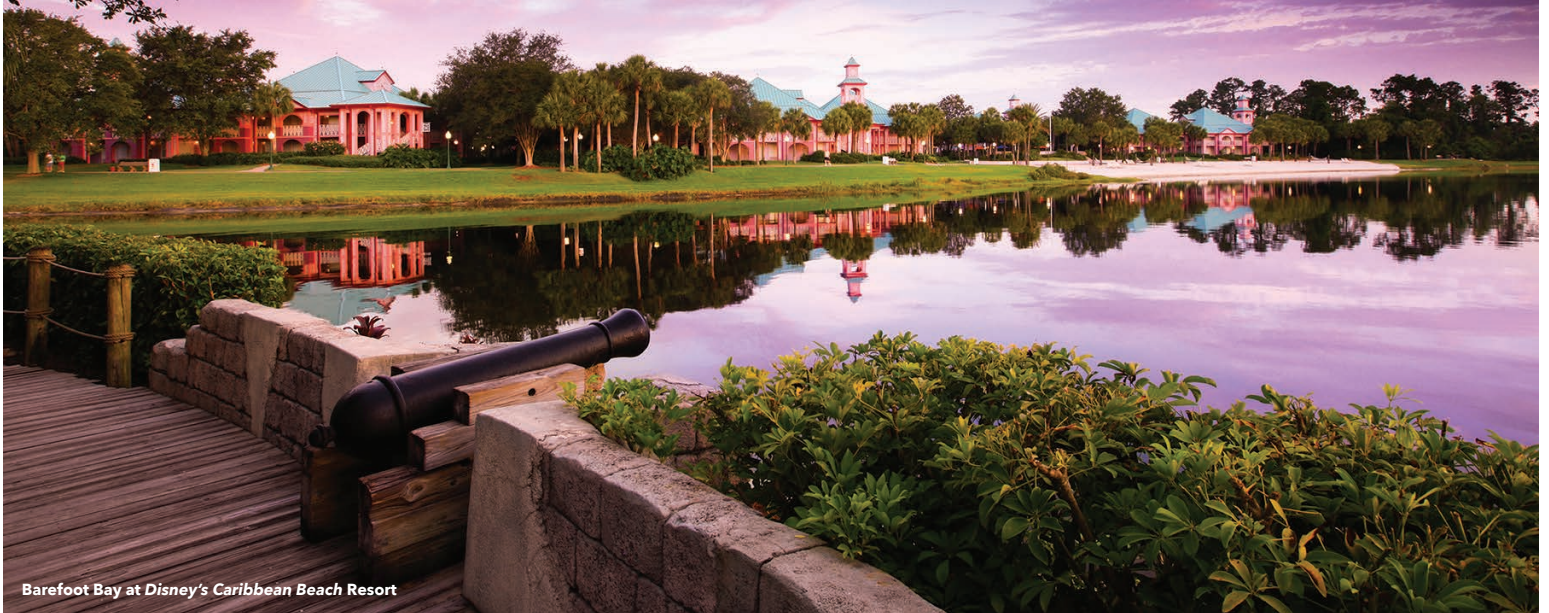
Barefoot Bay at Disney's Caribbean Beach Resort

This Disney Moderate Resort celebrates the spirit of tropical locales—from the legacy of colonial forts and architecture to lively markets, exotic birds and relaxing strolls on the sand. Each island complex is bright, airy and colorful with access to a 45-acre lake and sandy beaches.